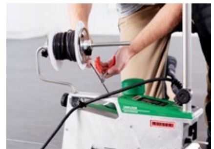
Integrated side cutter