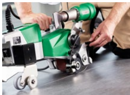
Welding rod pressure roller can be raised and locked