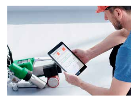
Quality assurance through LQS

Thanks to LQS, Monitored Welding Assistant and Leister's standard nozzle, the UNIROOF 700 automatic roof welding machine is well-suited for welding flat roofs and sets a new standard in the roof industry.