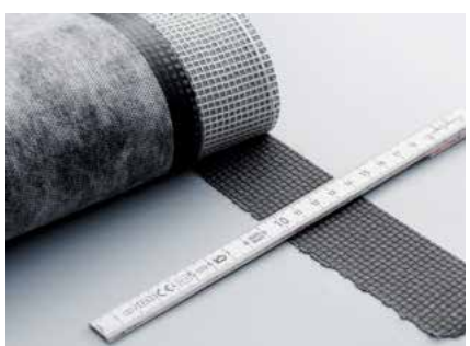
Standard nozzle for optimum weld seam width