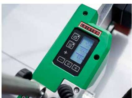
Regulated welding parameters

The compact UNIROOF 300 automatic welding machine is ideally suited for welding medium to large, flat roofs and is ideal as an entry-level machine due to its simple operation.